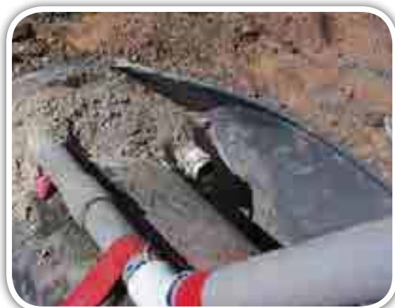
Grout can be seen exiting from the PVC port

The density (unit weight) of the material has a greater effect on the performance of the culvert rehabilitation than the compressive strength value of the grout. Practically any grout selected will be stronger than the bedding material around the host pipe. This is the material that the grout is intended to replace and serve in its absence.