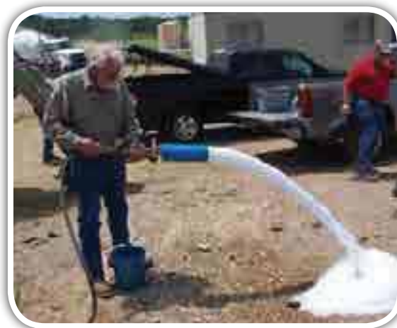
To produce cellular grout, a concentrated foaming agent is required in combination with various types of foam generating equipment. This equipment may generate foam via air pressure or water pressure.

Cellular grout is a low density grout mix comprised of cement and water (or cement, fly ash, and water) with a foaming agent added to inject a large volume of macroscopic air bubbles into the grout mix. This admixture greatly reduces the density, or unit weight, of the grout mix, and often will result in 40% or greater air content in the finished product. A foam generator unit is normally required to obtain such a high percentage of air and to reduce grout density. Most additive manufacturers report a maximum of 20% to